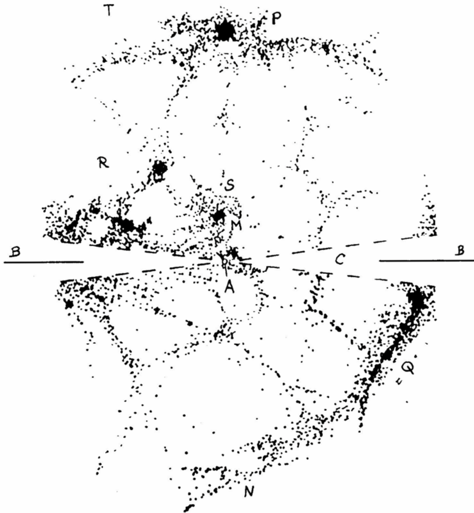
Figure 1. (Adapted from P. Léna, Les Sciences du Ciel , 1996, Flammarion éd., Paris, p. 574). Distribution of galaxies projected perpendicularly to the galactic plane. A: Our Galaxy; B: Plane of our Galaxy; C: Regions obscured by the Milky Way; M: Virgo cluster; N: Sculptor cluster; P: Coma supercluster; Q: Perseus-Pisces supercluster; R: Hydra-Centaumis supercluster; S: Virgo Supercluster; T: The whole spherical supercluster of galaxies.

We must indeed solve the GR equations, taking into account, at least between the scale of the neutron stars and that of the large scale (not yet observable) Universe, the existence of a hierarchy of structures. We know how to make \rho = \text{cst} in the GR equations. But how to make \rho = \rho(R) , we do not know; one can only guess intuitively a few things: the equations written for a certain density show us that a wholly dense Universe has a “life-time” shorter than a wholly non-dense Universe; this implies that non-dense regions expand slower, and that H there must be smaller. It implies also that H_i , as measured using a given galaxy G_i , is an average \langle H \rangle over the true, local H , which varies from point to point in the Universe – even from author to author.... This idea was developed without much echo (Pecker,