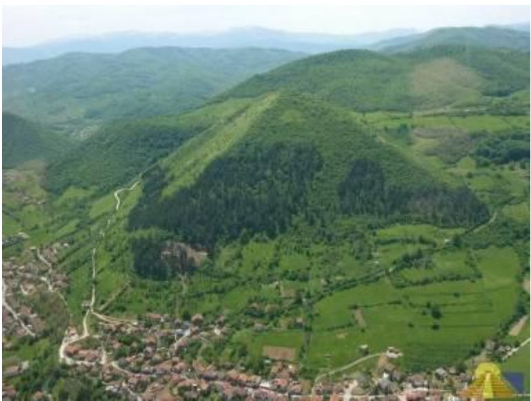
Bosnian Pyramid of the Sun, Visoko, Bosnia-Herzegovina

Perhaps by changing our beginnings we can change our present and our future for the better.