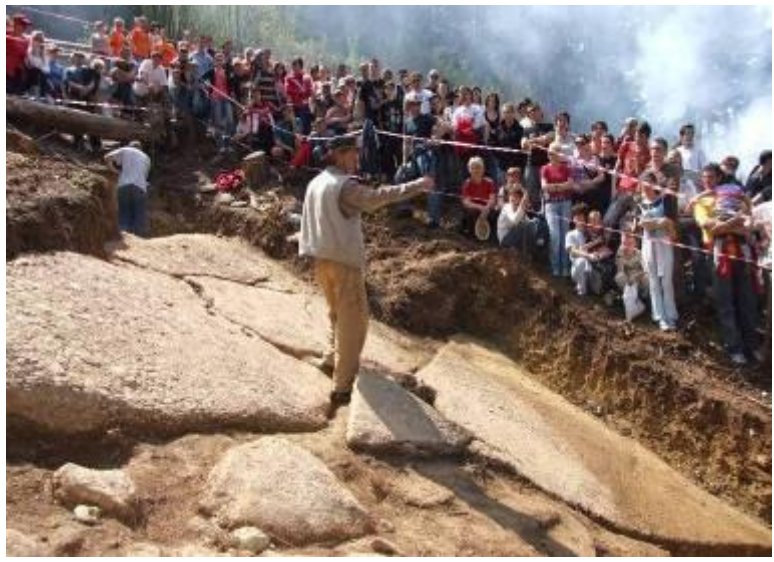
Bosnian Valley of the Pyramids have been visited by 500,000 tourists in a period 2005 to 2011