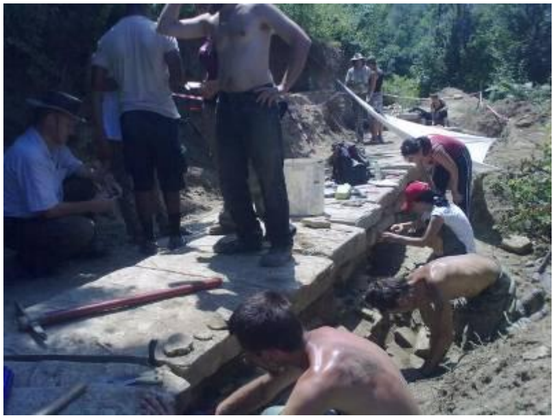
International Summer Camp for Volunteers attracts 500 volunteers from 6 continents every year; photograph shows excavated paved terrace on Bosnian Pyramid of the Moon