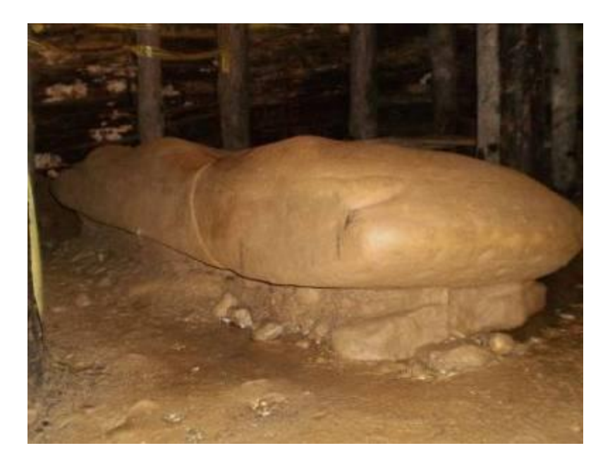
Ceramic sculpture "K-2" in underground labyrinth weigh 18,000 lbs