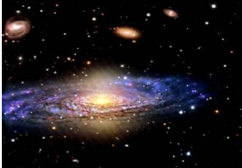
Galaxy NGC 7331 in Pegasus Constellation

Let's verify this by an example, which considers the recession speed of galaxy NGC-7331 with respect to our Milky Way.