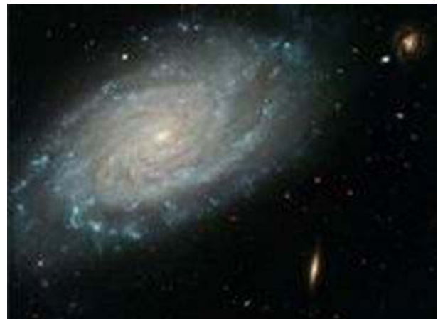
Fig. 2. Hubble/NASA example of Celestial Organization

For the purposes of this discussion, a complex, open, self-organizing system is defined as one which demonstrates the characteristics of the condition known as criticality. For purposes of illustration, at the grandest of scales, the Milky Way Galaxy [like all galaxies found in the cosmos] is a complex, open, self-organizing system [40].