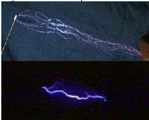
Figure 1. Spark discharges from a Tesla coil showing greater intensity in the center.

Due to the wide application and logical clarity of Maxwell's equations inconsistencies are often overlooked or minimized. However, as Einstein shows in his paper on special relativity they do exist and are important 8 .