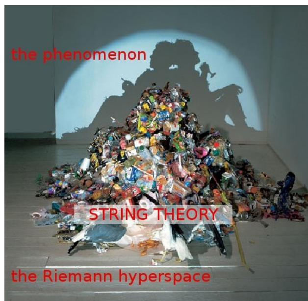
Fig.4.1: An artistic view of the Riemann hyperspace with the String Theory (Riemann manifold) as the rubbish.

Nothing is more easy than to invent a mathematical theory of ten dimensions (or more) with enough variable parameters to explain the four fundamental forces and (hopefully) all the elementary particles. It's only a hell of a job to find those parameters (see fig.4.1).