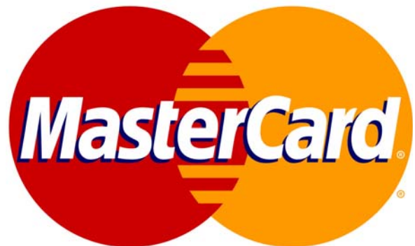
Fig. 1. MasterCard logo

There is another symbol which represents the interconnectedness of duality or Coincidence of Opposites, and that is the one I would like to focus on, as I have applied it to new technology. This symbol is called the vesica piscus [2] or Marriage Symbol for a good reason. It shows how opposites are linked in harmonious fashion. One circle represents the male aspect of reality and the other circle, the female. The two circles are interlocking showing that they share a mutual domain and are contrasting but not exclusive. This is also the most commonly utilized symbol in advertisements, a testament to the power of its influence. It is seen most strikingly in the logos for MasterCard (Figure 1), Kool cigarettes, and Double-Tree Hotels. Sometimes you will find the seeds of understanding in the strangest places. The author suggests this symbol must be a universal archetype of amazing proportions. It is a basic representation of how the past and the future are always merging to become the present, and how sometimes truth is stranger than fiction. This symbol represents the idea that balanced reciprocity allows for all-possibility. This is important not only for technological applications but for guidance in human affairs and the making of a civilized society.